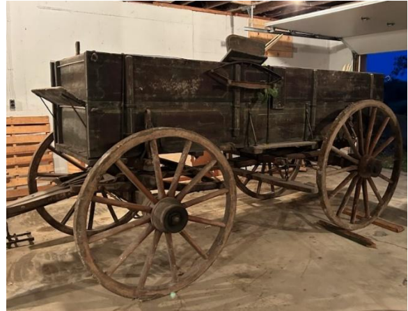
Civil War Era Supply Wagon

Following the buffet luncheon, we had a raffle for the kids and then a raffle for the adults. There were "barrel train" rides for the kids all day. The "barrel train" was loaned for the day by the Danny Schwinn Family, Easton. Later, we introduced the